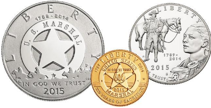
U. S. Marshalls Coins

From a reliable source at the recent FUN Show, "The Royal Canadian Mint will have 300 different offerings of coins in 2015."