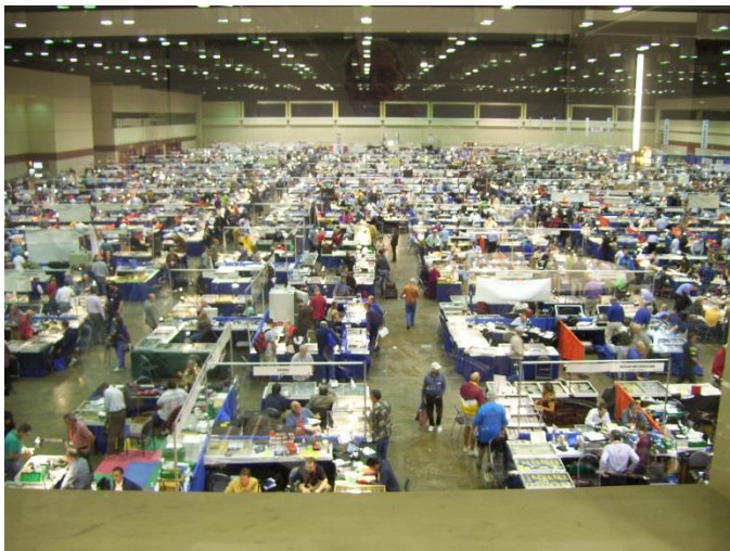
‘Part’ of the 2015 FUN Show