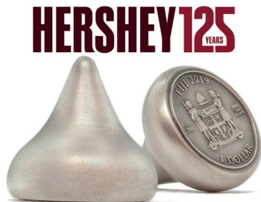
2019 Fiji 1.37 ounce $1