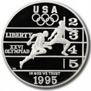
Cancelled 1995 Olympic die and 'Track' coin.