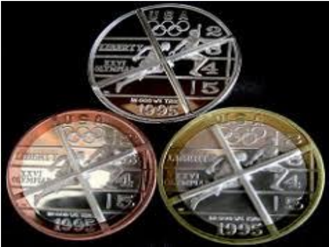
Medals struck by cancelled die.